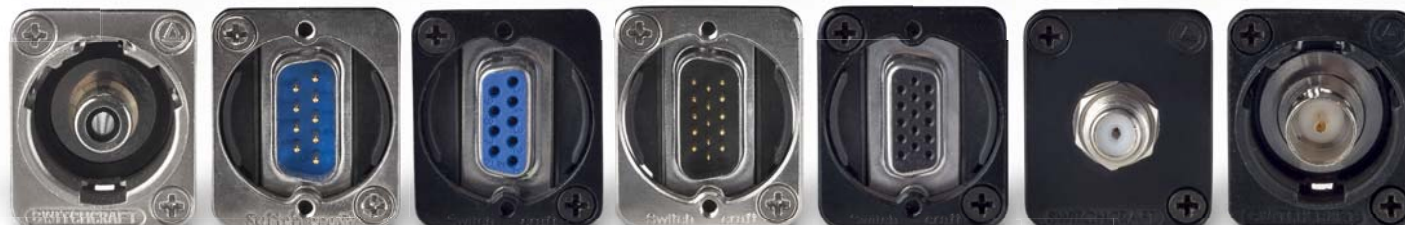
EHRCA2 EHDB9MF EHDB9FFB EHHD15MF EHHD15FFB EHFFB EHBNC2B