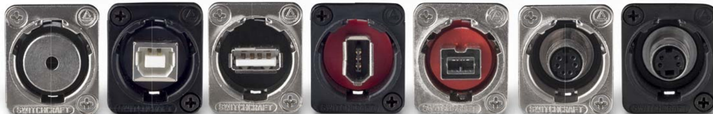
EH35MMMSC EHUSBBAB EHUSBAB EHFWX2B EHF800X2 EH6MD2 EHSVHS2B