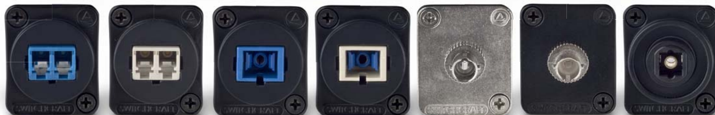
EHLC2 EHLC2M EHSC2 EHSC2M EHST2 EHST2MB EHTL2